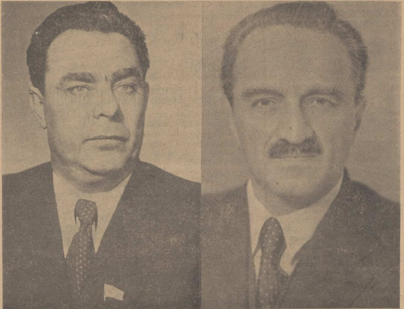
MIKOYAN SUCCEEDS BREZNYEV — Vice-Premier Anastas Mikoyan (Rt) has been appointed the successor of President Leonid Brezhnev of the Soviet Union.

Medicated Mexsana Skin Cream helps heal detergent hands. Its gentle lanolin softens dry, parched skin. 39¢, 70¢ jars.